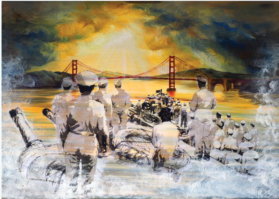
Painting by Irene Krauß

#1103 in 33:17 by © STEPHEN MELLO IGNA 11 Sep 2014