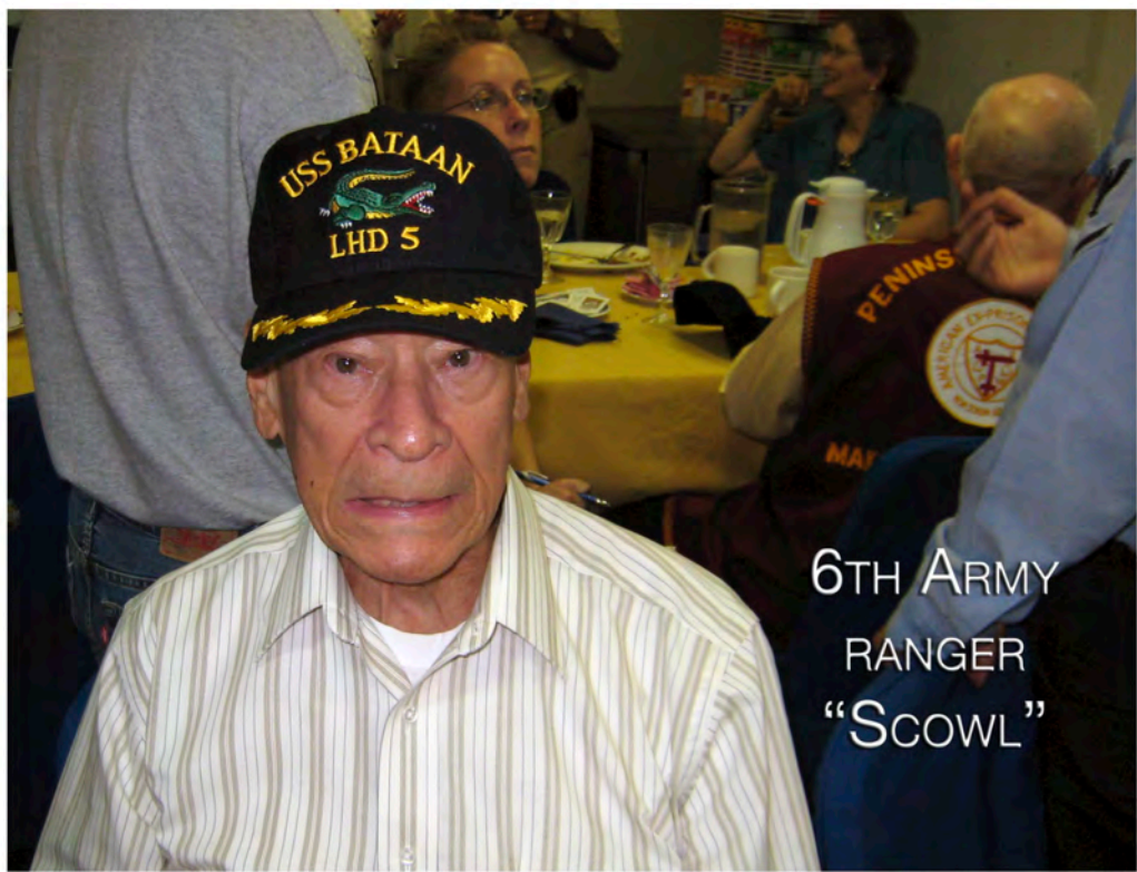
6TH ARMY RANGER "SCOWL"