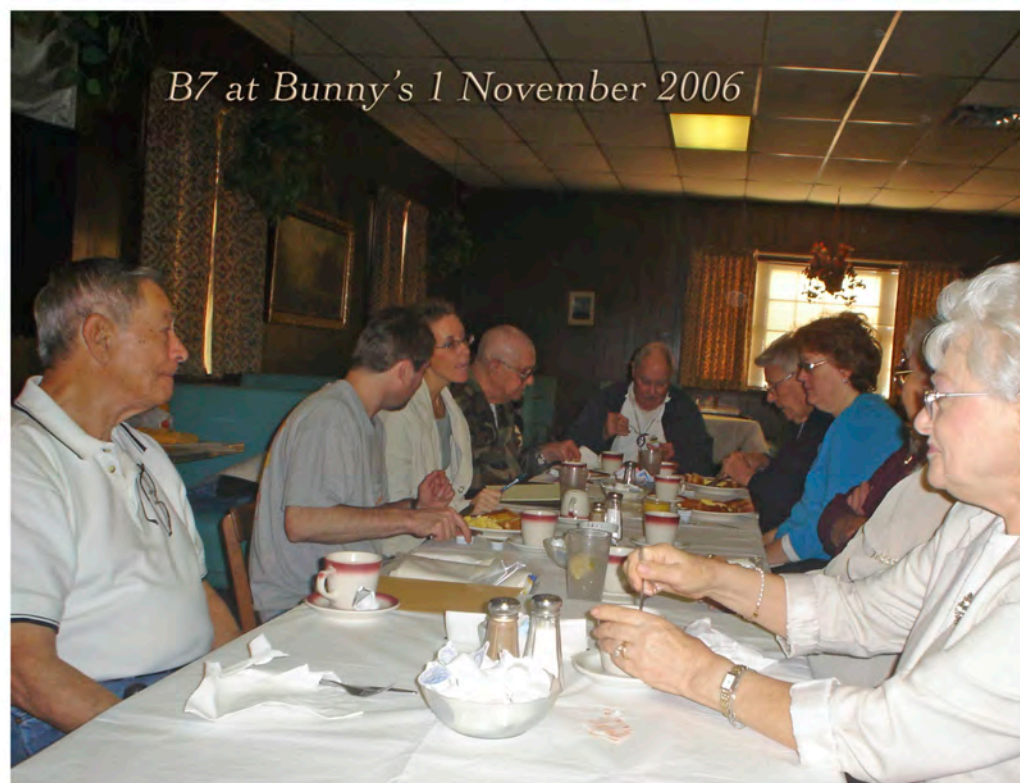
B7 at Bunny's 1 November 2006