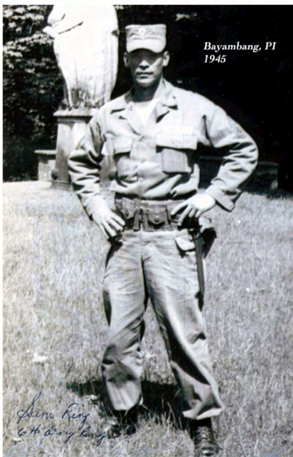
Bayambang, PI 1945