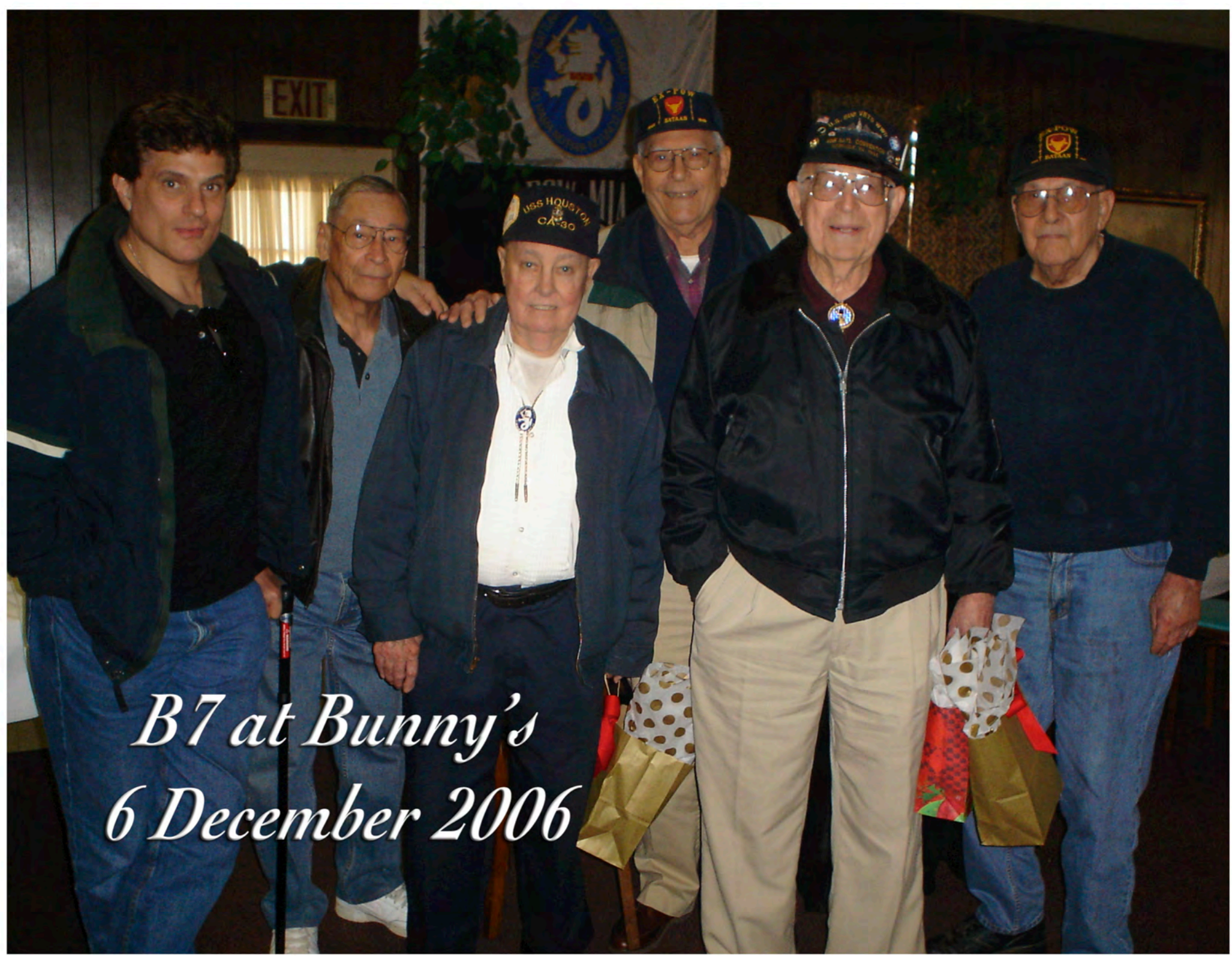
B7 at Bunny's 6 December 2006